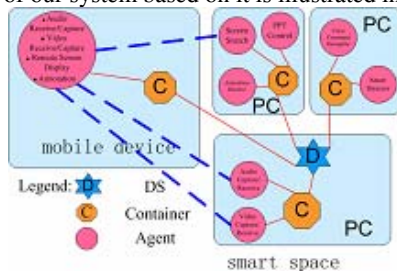
Fig. 1. The structure of ErmdClime based on Smart Platform

Since various multimedia modules for mobile collaborative learning must be coordinated and integrated seamlessly, the software infrastructure, which provides the runtime environment, common services as well as the development interfaces for these modules, plays a key role. The Smart Platform, a multi-agent platform which has been used in our Smart Classroom [3] project, now is augmented to support mobile devices in our current research and is adopted as the software infrastructure for ErmdClime . The structure of our system based on it is illustrated in Figure 1.