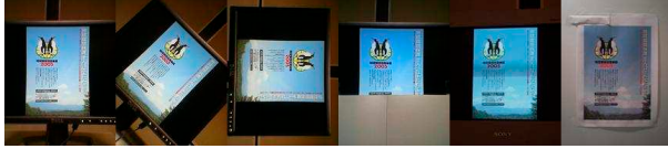
Fig. 4. Sample Images for Testing Image Database